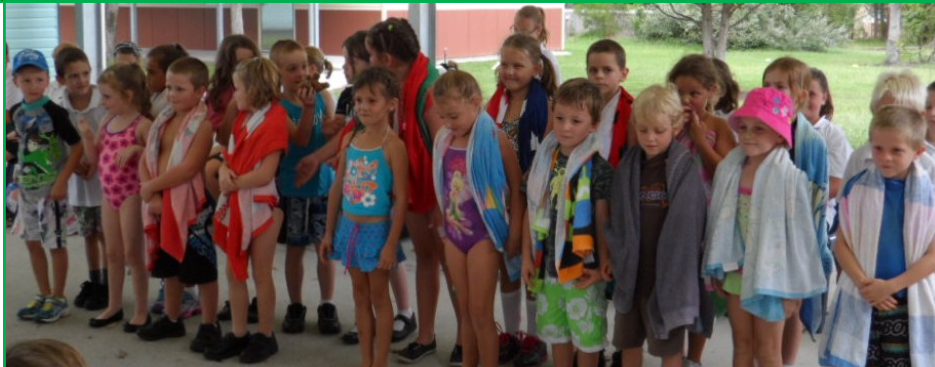
Our bathing beauties in 12B entertained us at last weeks assembly with the poem, "WAVES"

Weekly Newsletter Number 4 Tuesday, 26 February 2013