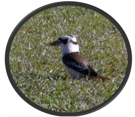
A friendly little visitor to our school.

Dear Parents, Carers and Community Members,