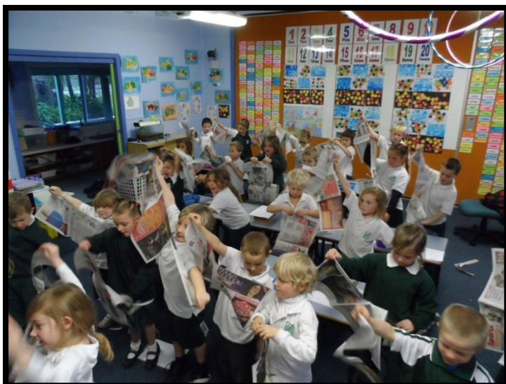
Exploring music with paper