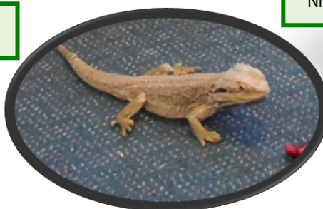
Spike enjoying his lunch with the children

Dear Parents, Children in K/1/2 require a 2 litre cleaned milk bottle with lid and a square 2 litre ice-cream container for an upcoming project. Please send these into class over the next two weeks.