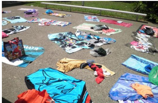
No, this isn't the Lansdowne Laundry Service. Swimming costumes and towels dry out each afternoon after children return from swimming.